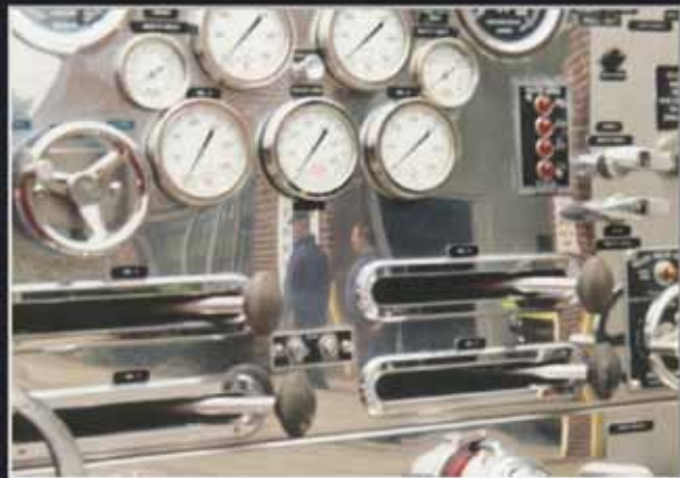
Pictured above in matte frames are a selection of photographs from his portfolio.